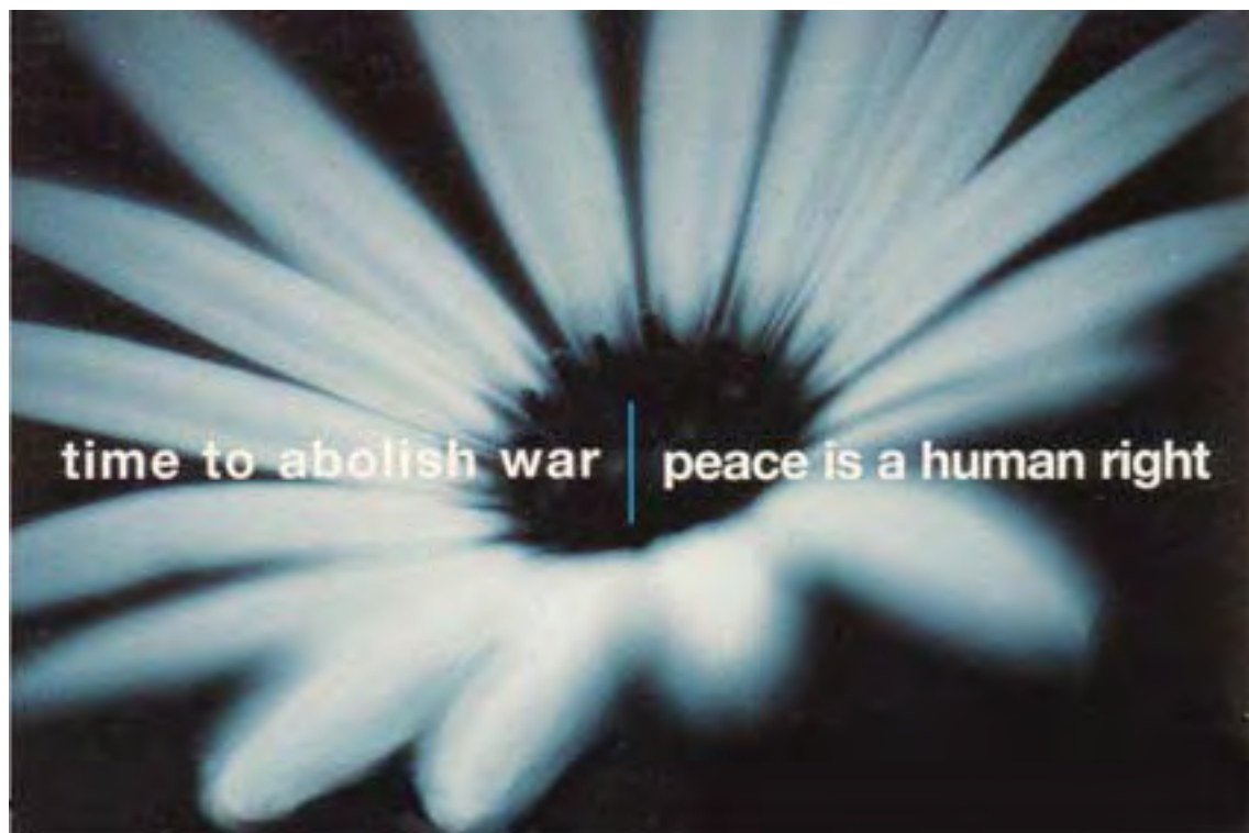
Figure 1: From the Hague Appeal for Peace website. 1