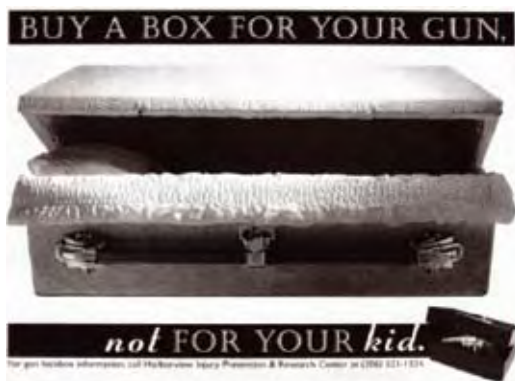
Fig 3. Example of a safe storage campaign poster