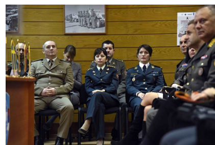
Closing Ceremony for Gender Training of Trainers – certificates awarded to participants