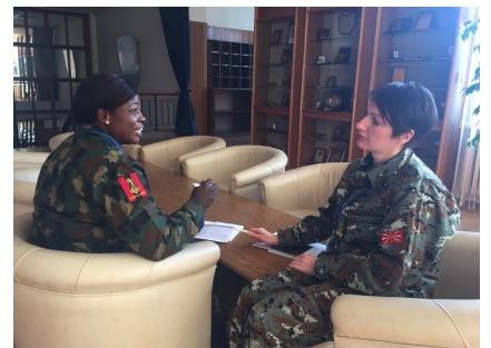
Gender Trainers from the Western Balkans delivering GTOT for African militaries