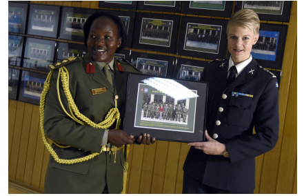
The GTOT was organized in close cooperation with the Nordic Centre for Gender in Military Operations