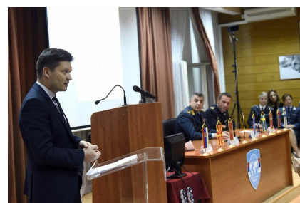
Closing Ceremony for Gender Training of Trainers – certificates awarded to participants