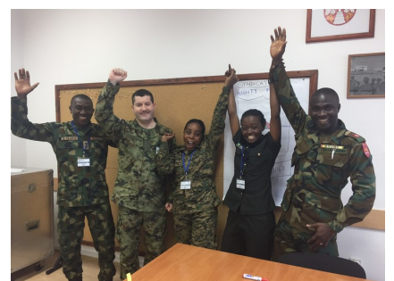
Gender Trainers from the Western Balkans delivering GTOT for African militaries