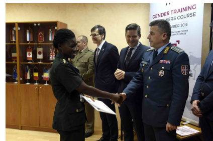
Closing Ceremony for Gender Training of Trainers – certificates awarded to participants