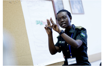
Students discussing the integration of gender perspective in education and training and preparing for exam during the Gender Training of Trainers Course