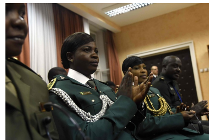
Closing Ceremony for Gender Training of Trainers – certificates awarded to participants