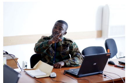
Students discussing the integration of gender perspective in education and training and preparing for exam during the Gender Training of Trainers Course