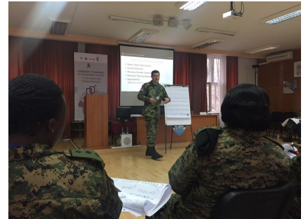
Gender Trainers from the Western Balkans delivering GTOT for African militaries