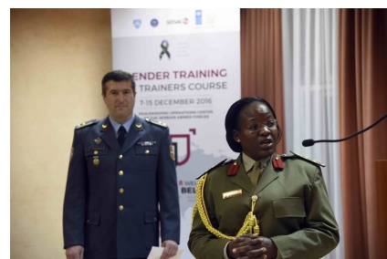
Closing Ceremony for Gender Training of Trainers – certificates awarded to participants