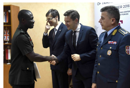
Closing Ceremony for Gender Training of Trainers – certificates awarded to participants