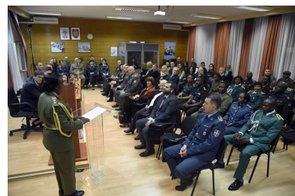
Closing Ceremony for Gender Training of Trainers – certificates awarded to participants