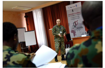
Gender Trainers from the Western Balkans delivering GToT for African militaries