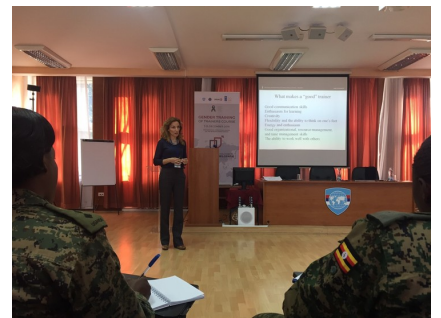
Gender Trainers from the Western Balkans delivering GTOT for African militaries