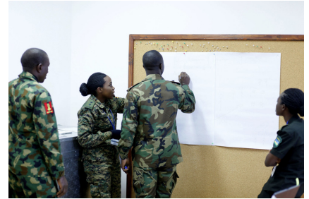
Students discussing the integration of gender perspective in education and training and preparing for exam during the Gender Training of Trainers Course