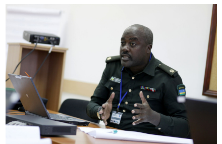
Students discussing the integration of gender perspective in education and training and preparing for exam during the Gender Training of Trainers Course