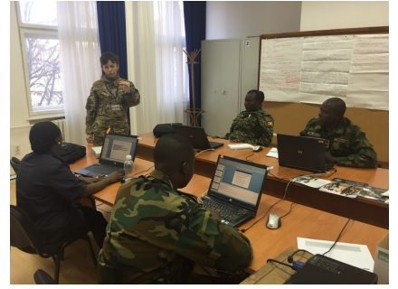
Gender Trainers from the Western Balkans delivering GToT for African militaries