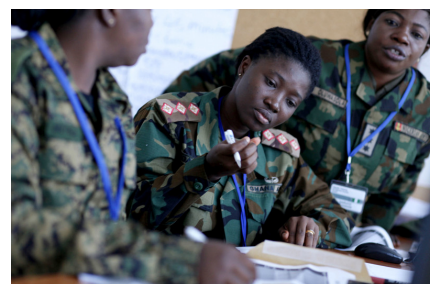
Students discussing the integration of gender perspective in education and training and preparing for exam during the