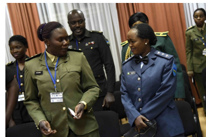
Closing Ceremony for Gender Training of Trainers – certificates awarded to participants

The course was organized through UNDP RBEC's Regional Security Sector Reform Platform (RSSRP) that has been developed in cooperation with the Governments in South East Europe with the aim to foster South-South Cooperation through provision of quick, short-term targeted technical support. The GTOT was delivered by Gender Trainers from the UNDP-supported Regional Network of Gender Trainers in the Western Balkans with seven