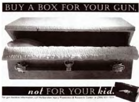
Fig 1. Example of a sub-weapon campaign poster.