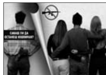
Picture 7: SALW Awareness in Macedonia, 2003.

In the 2003 SACIM project in Macedonia, USD$290,000 of a USD $600,000 budget (48%), was specifically committed to SALW awareness. The campaign was objectively assessed as being highly successful, with an increase of risk and impact awareness of 80% after the campaign. Yet, for future projects it would be useful to know whether this is the sort of percentage that should be committed to awareness, and whether there is an optimum percentage funding range, (25 - 40% for example).