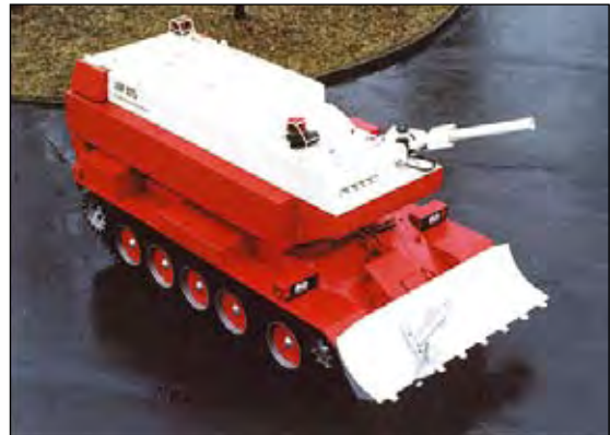
Firefighter-55 developed by VOP 025, Novy Jicin s.p. (Czech Republic). Based on T55 chassis and has a remote control capability

There is a limited potential for the conversion of a number of surplus and redundant land heavy weapon systems to commercial use. This is permitted under the CFE Treaty (Section VIII to the Protocol on Procedures). Suggested uses include, among others, mine clearance and flails, non-lethal riot control, fire fighting, ice breaking and support to heavy civil engineering projects. 22 Regrettably this solution will be 'market driven' and future potential sales are unlikely to represent more than a few per cent of the current surplus at best. The resulting systems can be complex, maintenance intensive and are expensive to operate. Companies such as VOP 025 in the Czech Republic are well established already in this 'niche' market, have the market lead and competing with them from a 'start up' position would be a 'high risk' strategy unless a firm market was identified and established. There are complex heavy engineering issues and significant financial investment required for the conversion from tank production and maintenance to this particular market.